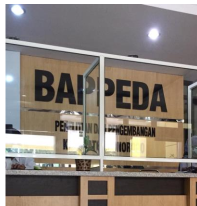
Figure 9 Bapedda Ponorogo Office

Furthermore, the entrepreneur coordinator and the Service Team coordinated with the One-Stop Integrated Service Unit of the Ponorogo Health Service.