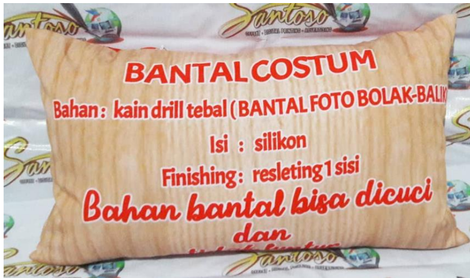
Figure 5 Custom Pillow Product Design

Through this activity, several outputs of packaging product design were obtained by participants. Unfortunately, not all participants successfully designed their products; only about 50% of participants succeeded. One of the contributing factors is that participants have difficulty when not accompanied directly; besides that, participants are also not used to getting material online. The following are some of the product design results produced by participants: