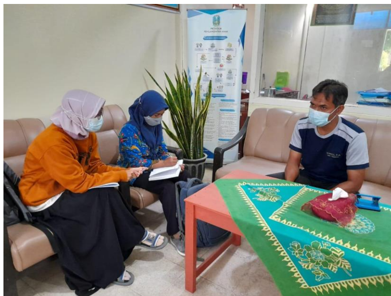
Figure 4 Submission of PIRT Requirements

Until now, the process of fulfilling the completeness of PIRT has been carried out by the entrepreneur and the entrepreneur has submitted a PIRT to the Health Office and is waiting for the process of issuing PIRT.