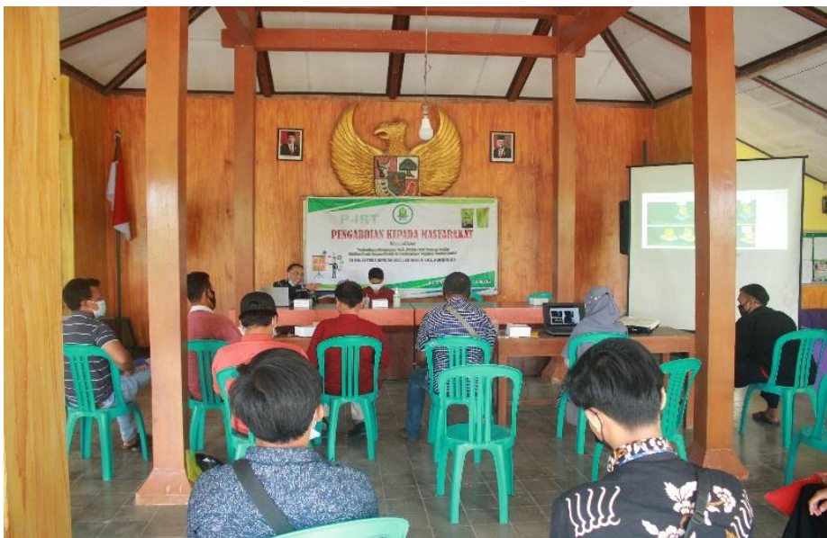
Figure 3 PIRT Business Licensing Training Activities

Permits or permits are one of the fields of administrative law that are mostly used by the public, especially business actors. Licensing is a form of providing a declaration of validity to individuals as business actors / granting business licenses in the form of company registration marks and business licenses. A business license or 22 A commercial license is an official document issued by an authorized body that indicates that a person or organization is legally / permitted to carry out a certain company or activity. Thus, there is certainty in running a business and enjoying proper comfort and security to make a greater contribution to the 'business license' in establishing a company, especially for micro, small and medium enterprises (MSMEs). In addition, this license can increase the added value of production, provide products and services for the needs of society, absorb jobs, and spread entrepreneurial development.