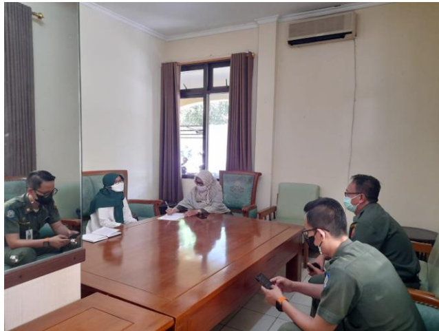
Figure 3 Coordination with the Ponorogo Health Office

In this coordination process, the Health Office explained the terms and procedures for submitting PIRT. In detail, according to the explanation of the Health Office, the management of PIRT (Household Industrial Food) permits requires several requirements such as the following: 1) Photocopy of the identity card (KTP) of the home business owner; 2) Photographs of 3×4 home business owners, 3 sheets; 3) Certificate of business domicile from the sub-district office; 4) Site plans and building plans; 5) Certificate of puskesmas or doctor of health and sanitation examination; 6) Application for a food or beverage production permit to the Health Office; 7) Data on food or beverage products produced; 8) Samples of the production of food or beverages produced; 9) Labels to be used on food and beverage products produced; 10) Include the results of laboratory tests suggested by the Health Office; 11) Attend Food Safety Counseling to obtain SPP-IRT.