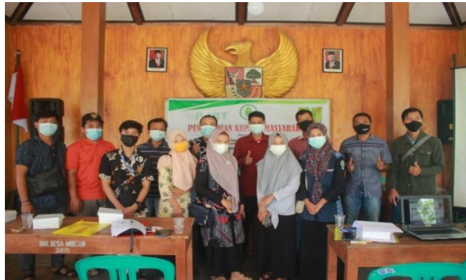
Figure 1 Closing of Training Activities for Product Design and Packaging Materials

Packaging is often synonymous with " the silent man/girl ," which refers to the fact that there is no waiter to indicate the product's superiority. Therefore, packaging can informatively convey the quality of the product like a seller to buyers. Another aspect related to packaging is the ability of packaging to influence consumers so that they do not easily switch to other products. Packaging must be able to create 18 Signs in the human subconscious or, in short, packaging has a role as a brand identity . 19