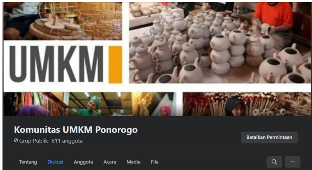
Figure 1 Facebook Kumonitas UMKM Ponorogo

In addition, one of the trainees is also a community member.