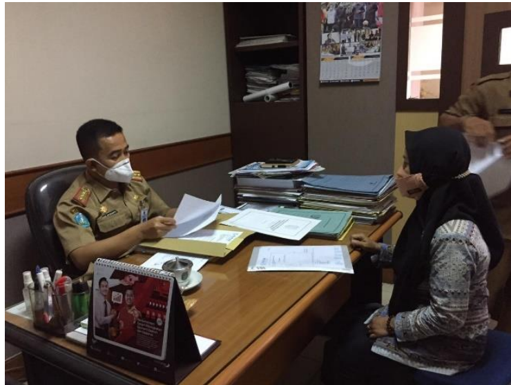
Figure 10 Permit Management in Subdistricts

Until now, the process of fulfilling the completeness of PIRT has been carried out by the entrepreneur and the entrepreneur has submitted a PIRT to the Health Office and is waiting for the process of issuing PIRT.