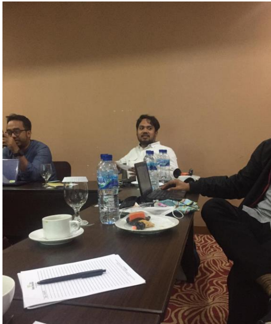
Figure 2 Coordination Activities for the Formation of Entrepreneurial Communities in Mrican Village