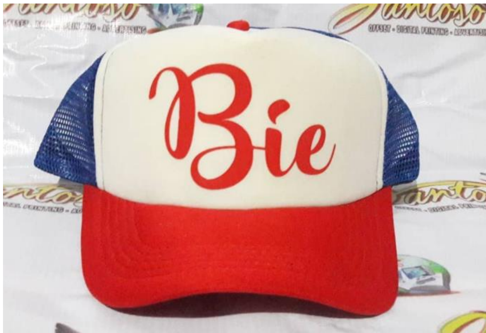
Figure 6 Couple Hat Product Design