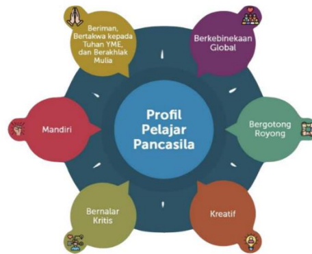
Gambar 1 Enam Dimensi Profil Pelajar Pancasila

to a big question in the education system in Indonesia. The Pancasila student profile was created as an answer to one big question, about what kind of competence the Indonesian education system wants to produce. These competencies include being competent, having character and behaving in accordance with the values of Pancasila. 24