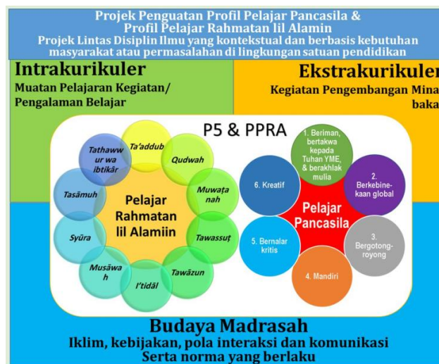
Figure 2; Pancasila Student Profile Achievement Overview and Student Profile Rahmatan Lil 'Alamiin 26

In addition to applying the Pancasila student profile above, at the same time students also practice moderate religious values, both as Indonesian students and global citizens. The values of religious moderation include: 1. Civilized ( ta'addub ); 2. Exemplary ( qudwah ); 3. Citizenship and nationality ( muwatanah ); 4. Taking the middle way ( tawassuṭ ); 5. Balanced ( tawāzun ); 6. Straight and firm ( I'tidāl ); 7. Equality ( musāwah ); 8. Deliberation ( syūra ); 9. Tolerance ( tasāmuh ); 10. Dynamic and innovative ( taṭawwur wa ibtikār ); The picture of the learner as profiled above can be illustrated below;