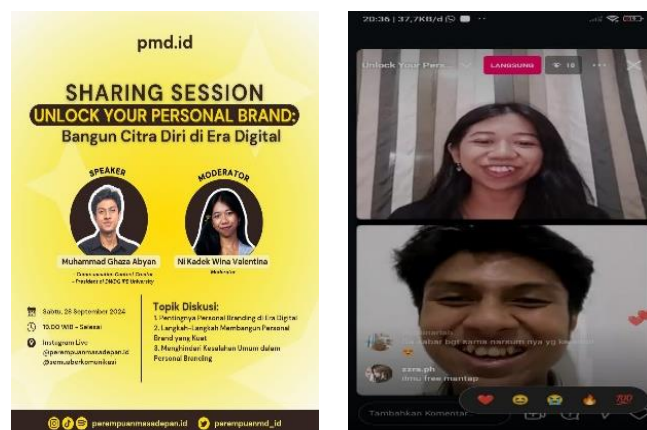
Figure 2. Live Instagram program discussing topics related to self-development

The implementation of community empowerment programs utilizes the available technology. Figures 1 and 2 show that ease of access to the program offered has spatial flexibility. However, respondents assessed that the implementation of empowerment programs in this community was just as good if performed offline. This can be performed in real and direct ways.